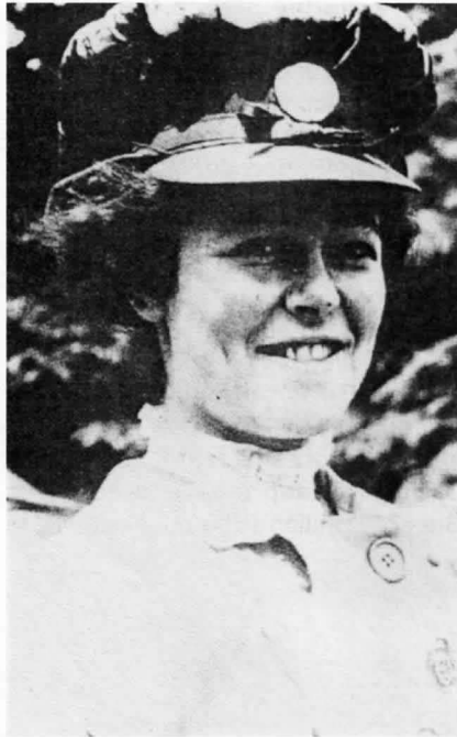
Alice Ramsey, in her driving cap, pictured at the wheel of the Maxwell roadster in which she drove across America in 1909.

Alice took driving lessons from the Maxwell dealer, and began driving her roadster up and down the roads near her home. She took her friends on jaunts throughout New Jersey and